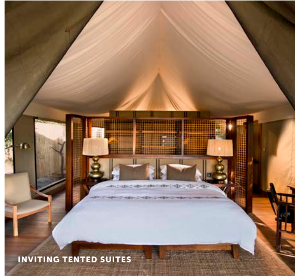
INVITING TENTED SUITES

Blending harmoniously with the environment, nine tented suites (including a family option) are set on raised wooden platforms, cradled under a canopy of towering ebony trees.