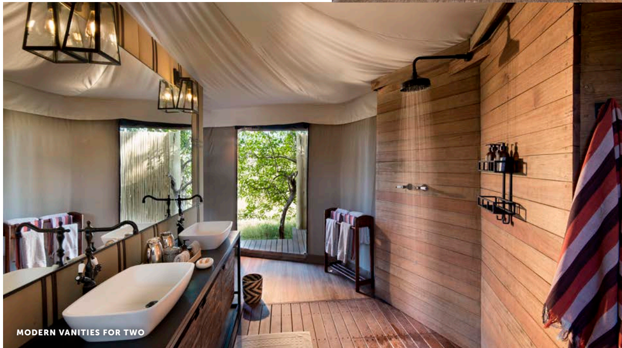
MODERN VANITIES FOR TWO