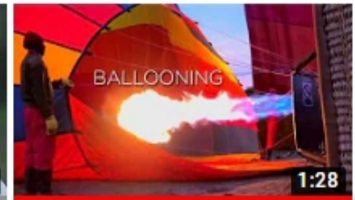
Great Migration Camps 2019 Promo