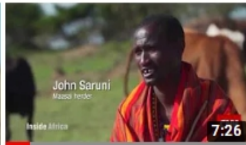
Inside Africa - CNN "the Great Migration" Part B