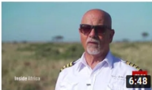
Inside Africa - CNN "The Great Migration" Part C