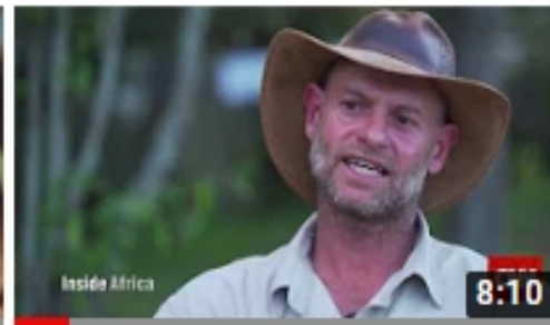
Inside Africa - CNN "The Great Migration" Part A