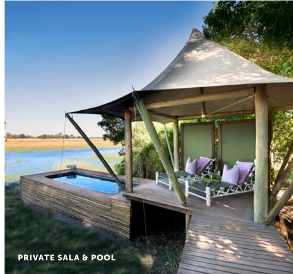
PRIVATE SALA & POOL

Designed to keep you close to nature, be captivated by spectacular views over the Delta and hear all the sounds of the wild from comfort of your chic tented suite.