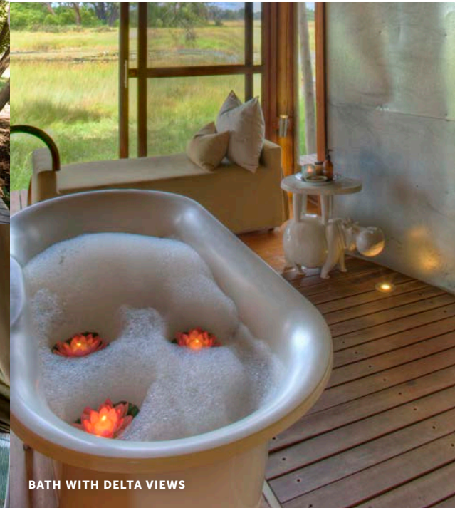
BATH WITH DELTA VIEWS