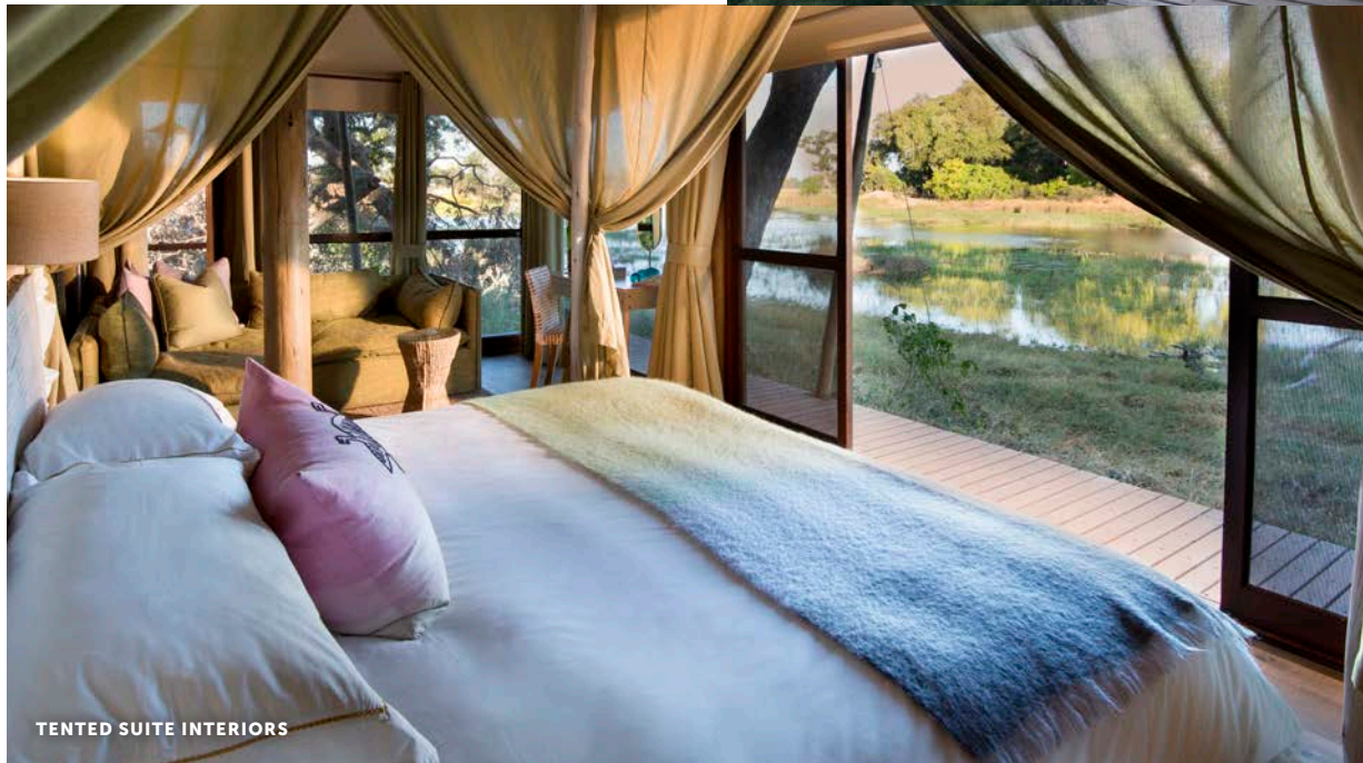
TENTED SUITE INTERIORS