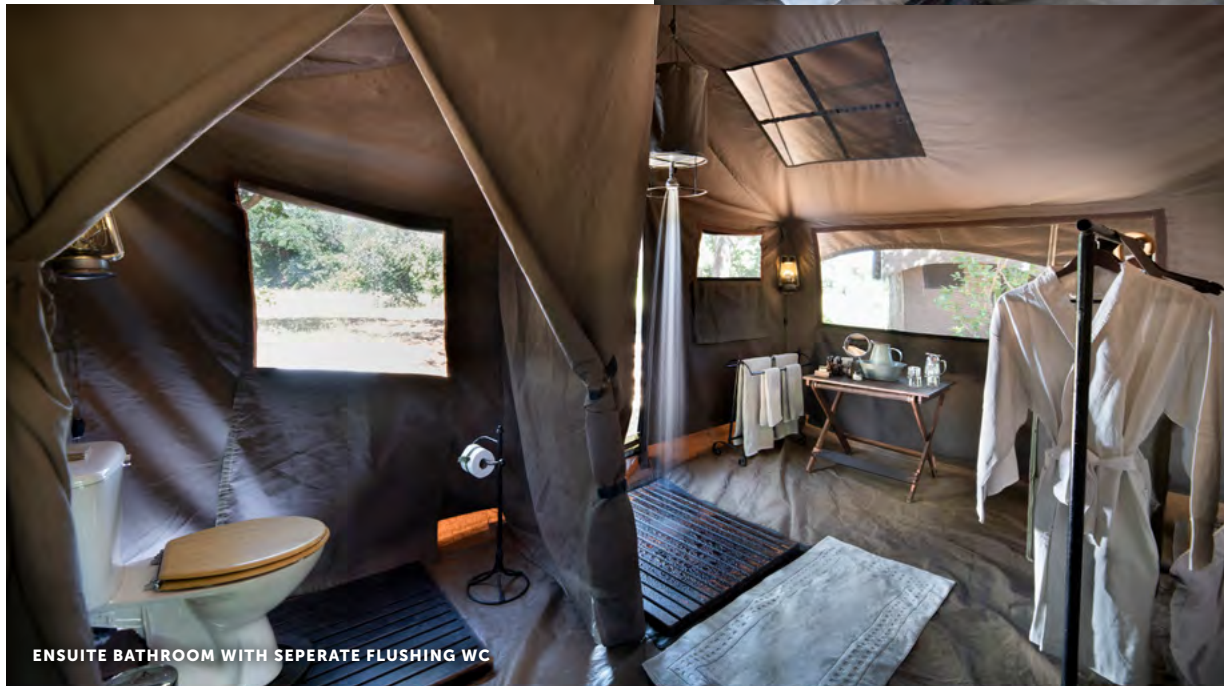
ENSUITE BATHROOM WITH SEPERATE FLUSHING WC