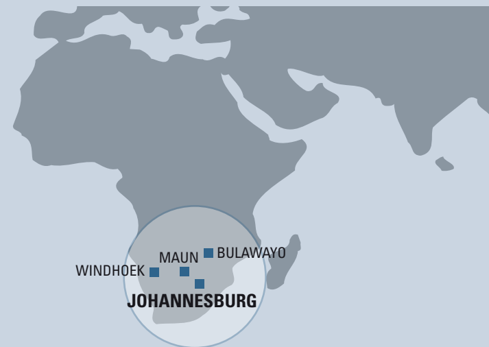
BEECH B1900 RANGE OUT OF JOHANNESBURG