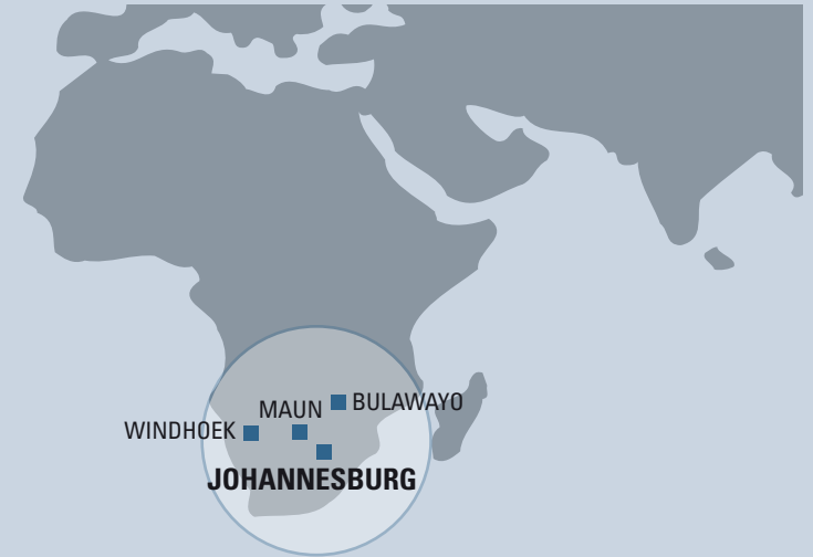
CESSNA 208 CARAVAN RANGE OUT OF JOHANNESBURG