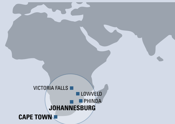
CESSNA CITATION MUSTANG RANGE FROM JNB TO CPT