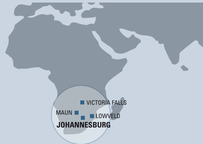
KING AIR B200 RANGE OUT OF JOHANNESBURG