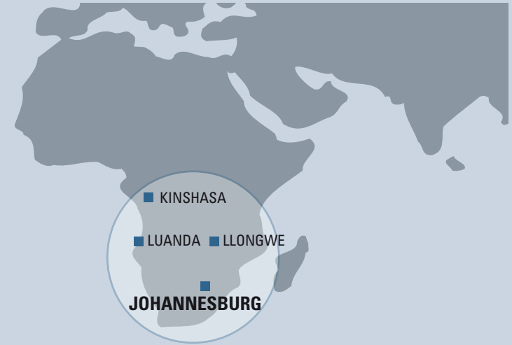
LEARJET 45 RANGE OUT OF JOHANNESBURG