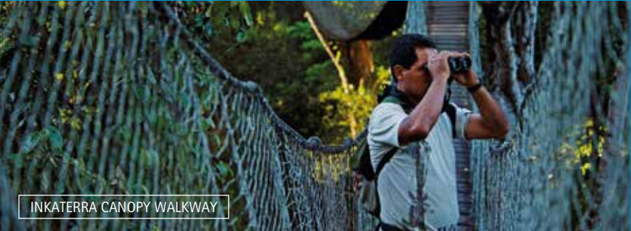
INKATERRA CANOPY WALKWAY