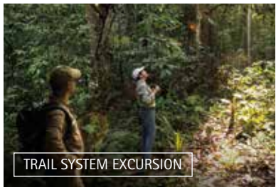
TRAIL SYSTEM EXCURSION