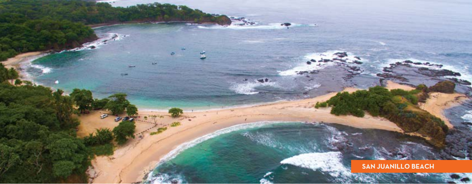
SAN JUANILLO BEACH