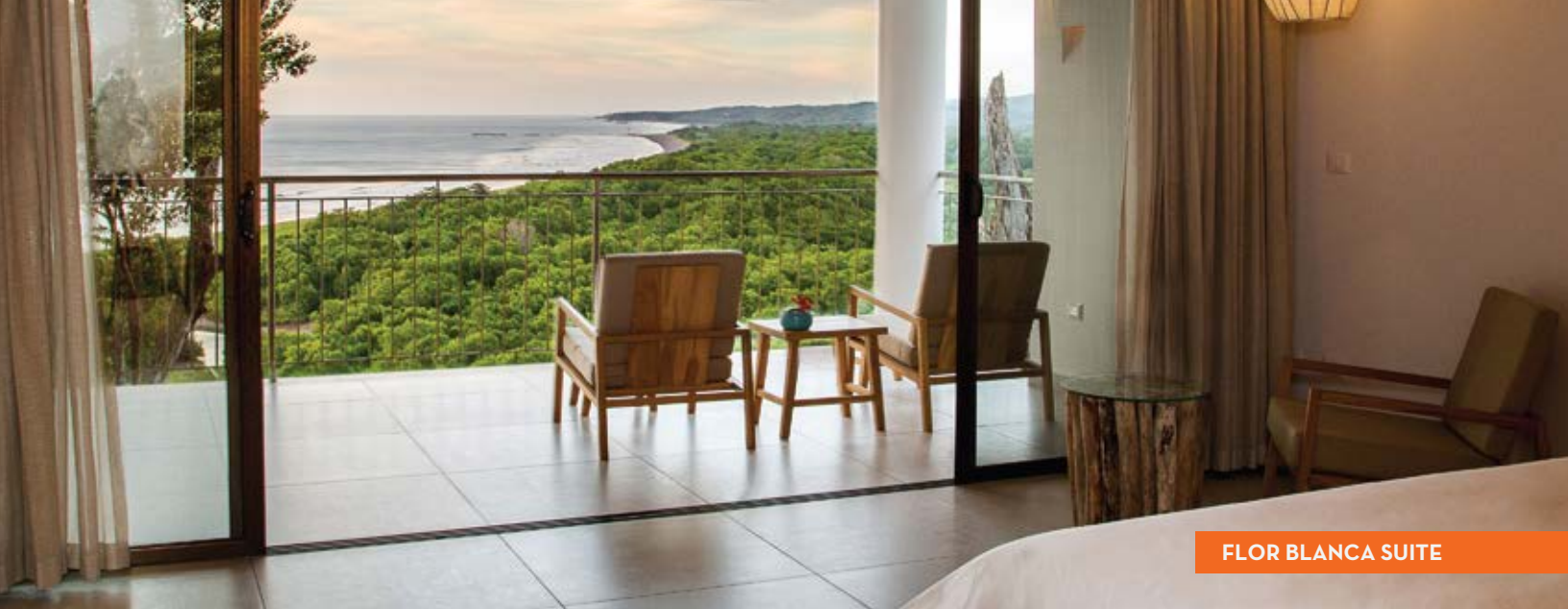
FLOR BLANCA SUITE