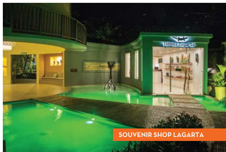
SOUVENIR SHOP LAGARTA