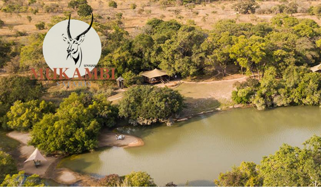
Fig Tree Bush Camp Fact Sheet

In June 2015 Mukambi Safaris opened this new luxury bush camp in an undiscovered part of Kafue National Park. It is named after the giant fig tree next to the boma (central area) overlooking a unique sandy lagoon. This lagoon maintains its alluring water throughout the season attracting an array of wildlife, including elephant, puku, impala, warthog, zebra, and hartebeest. Predators like lion, cheetah, leopard and hyena are regular visitors and the wild dog have been known to prey on the concentration of game.