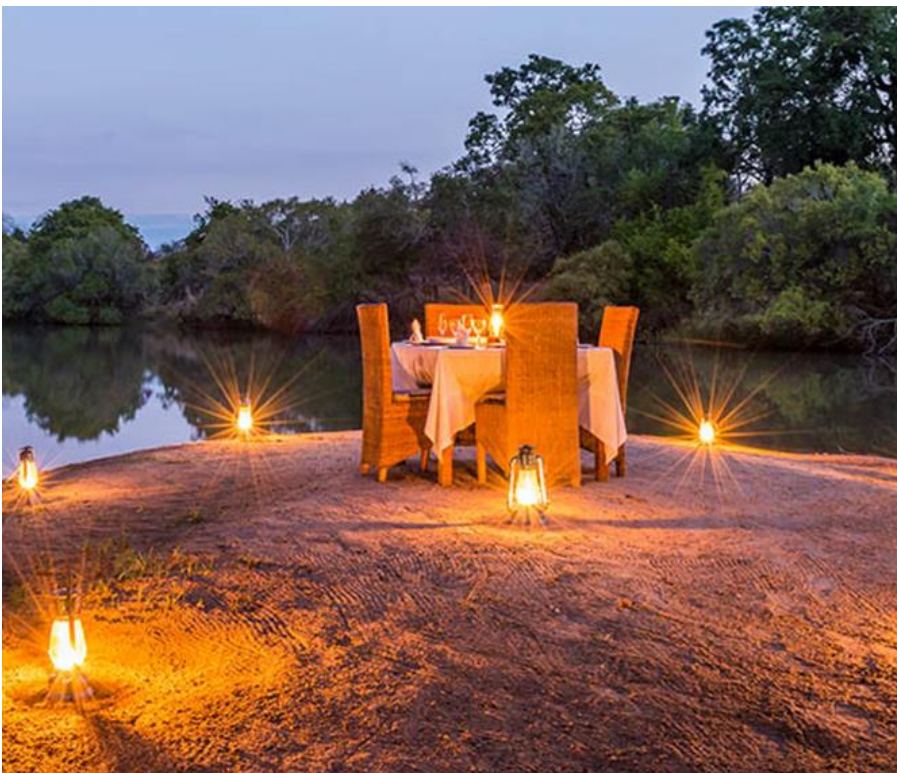
Fig Tree Bush Camp offers superb food and after a three-course supper guests will sit around a campfire, feet in the sand, gazing at the stars and listening to the sounds of the African Bush. Mukambi is famous for its excellent cuisine and friendly staff.